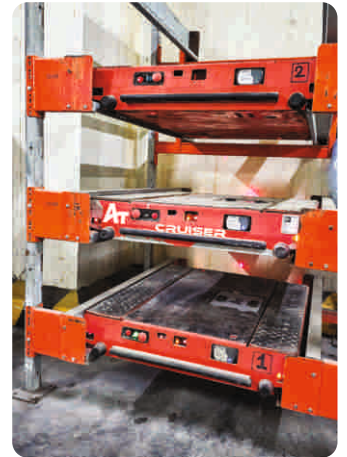
1. Shuttle Robot

We take pride in being one of the biggest players in the global seafood export industry, PROUDLY representing Bharat.